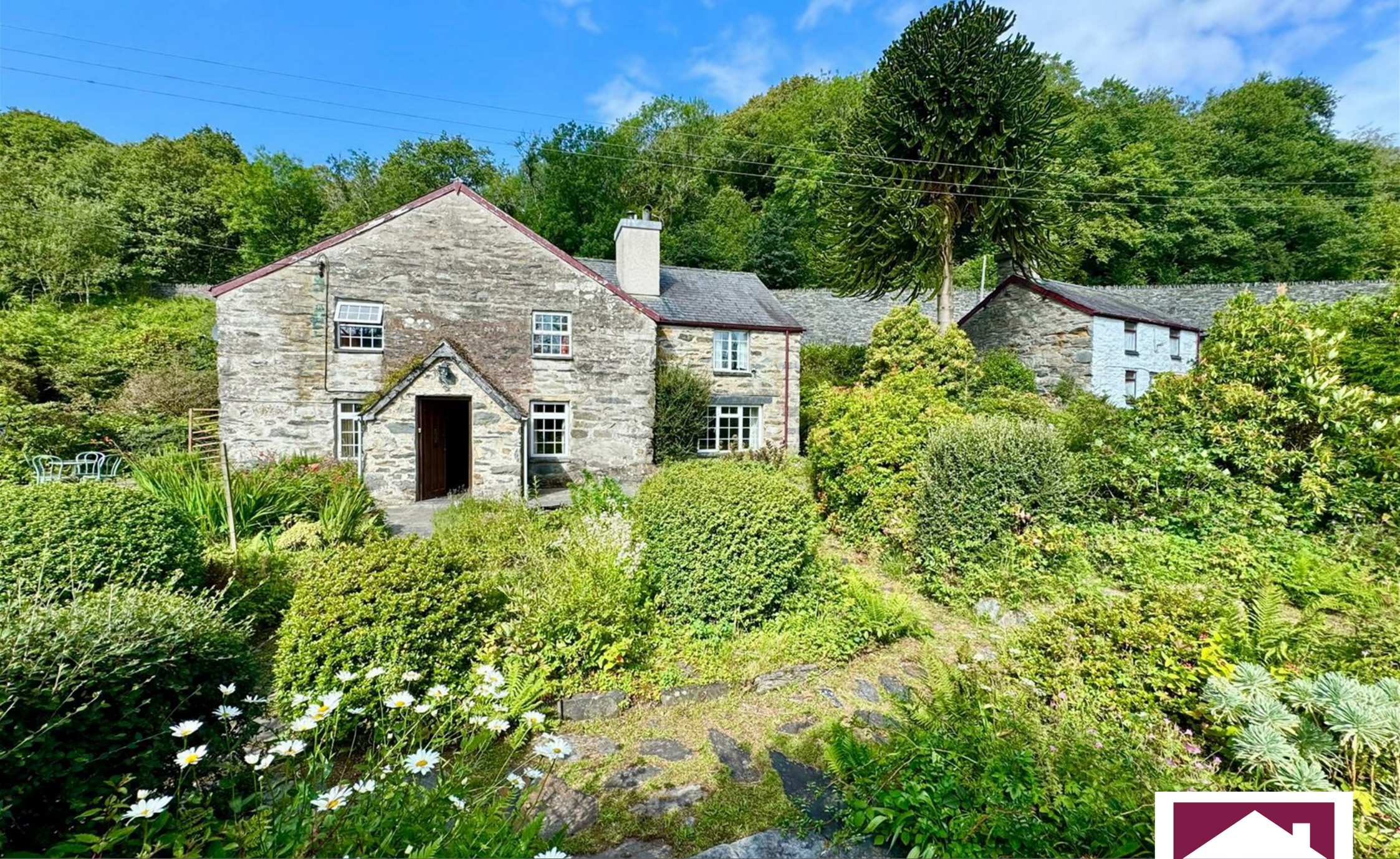
Minafon, Dolwyddelan Conwy LL25 0JD